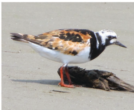
Ruddy Turnstone