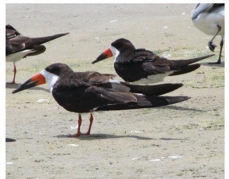
Black Skimmers

Turn on Boddeker Road (UTC 062) and pull into the parking area on the right before reaching the bridge. The sand spit across the water is excellent any time of year for Black Skimmer, American Avocet, Black-necked Stilt, Ruddy Turnstone, and various terns and gulls. In winter, check for Marbled Godwit, Black-bellied Plover, and Red-breasted Merganser.