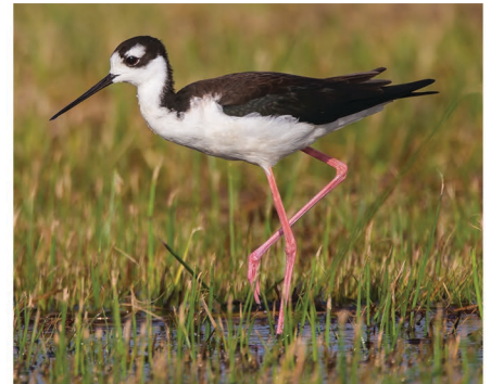
Black-necked Stilt

In winter, Blue- and Green-winged Teal, Mottled Duck, Northern Shoveler, Gadwall, and other waterfowl are common. Check the power lines on the left for Loggerhead Shrike and Eurasian Collared-Dove.