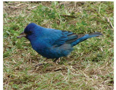
Indigo Bunting

Start your tour by visiting this small hidden gem, which can be found by taking TX 87 (Ferry Road) to TX 168. During spring, migrants including Indigo and Painted Bunting, House Finch, Baltimore Oriole, and various warblers are common. Check the small ponds year-round for Black- and Yellow-crowned Night-Heron, Little Blue and Green Heron, and other waders. Before you leave the parking lot, scan the power poles for Crested Caracara.